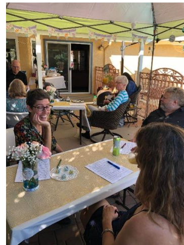
Baby Shower at the Bellamy's Nov. 3, 2018