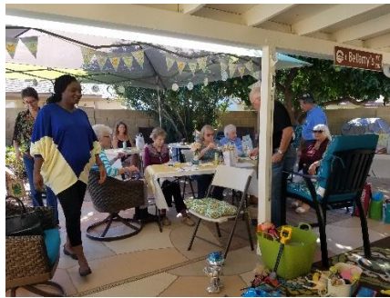
Baby Shower at the Bellamy's Nov. 3, 2018