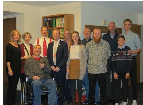
Christmas Eve Candlelight Service. Dec. 24, 2018 Fiedler Clan.