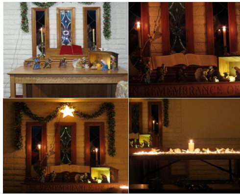
Christmas Eve Candlelight Service. Dec. 24, 2018.